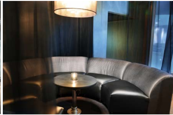
Alcove in the lounge