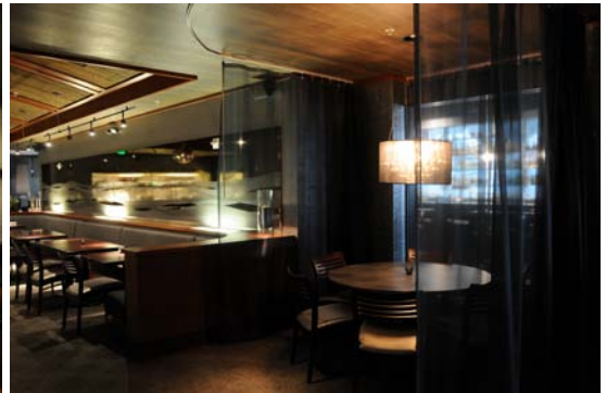
Alcoves in the Dining Room