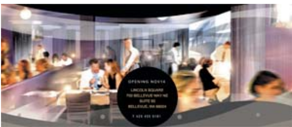
Opens NOVEMBER 14!

Pearl offers lunch and dinner, along with handcrafted signature cocktails, a vast selection of premium wine and beer, and gracious service. With daily happy hour, small plates and private dining, Pearl has options to suit every occasion. Pearl is sure to be a new high-water mark for hospitality in Bellevue and beyond.