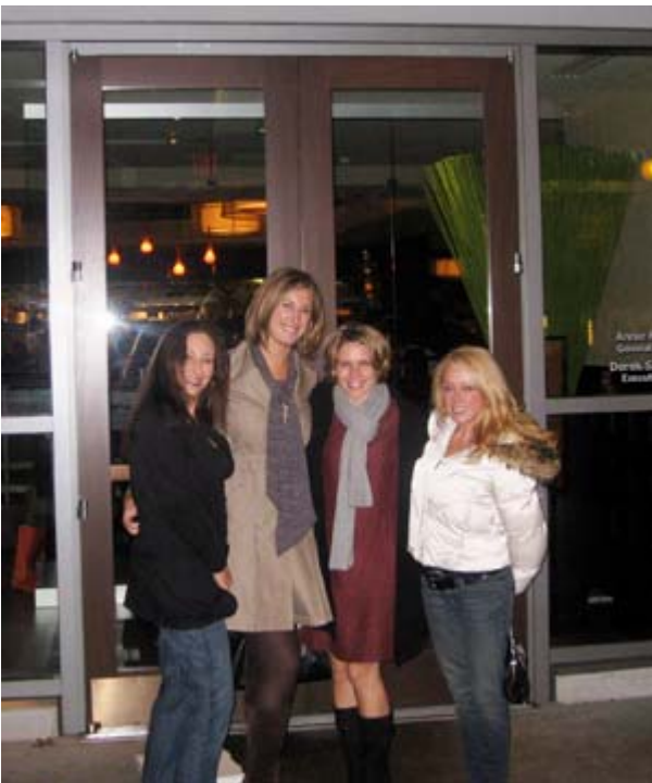
Bonding made easy